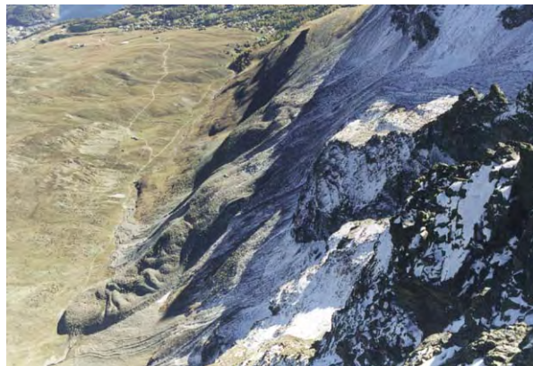
Figure 1. Oblique photograph of an active talus-derived rockglacier in the eastern Swiss Alps. The rockglacier root zone (= RRZ, see explanations in the text below) is partly visible in the snow-covered upper right of the picture.

Rockglaciers are landforms originating from periglacial talus ('talus-derived' rockglaciers) and/or glacier-transported debris, mostly from lateral and terminal moraines ('moraine-derived' rockglaciers). The occurrence of talus-derived rockglaciers (Fig.1) is influenced primarily by climatic and topographic preconditions (cf., e.g., Barsch 1996). They are found in areas characterized by specific topographic attributes; they occur, for example, within a certain altitudinal band, favour certain slope aspects, require a particular slope, and need a rock-contributing headwall above them (cf., e.g., Frauenfelder et al. 2003, Janke and Frauenfelder 2007).